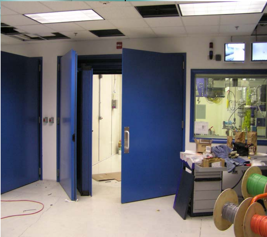
8' x 8' STC 48 Double-Leaf Door piggy-backed onto larger STC 60, fire rated, projectile rated, blast rated door—paired with an STC 62, projectile and blast resistant 4' x 8' window system. Wixom, MI