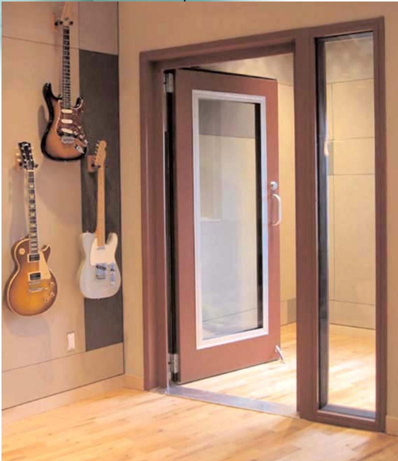
ABOVE: 3' x 7' STC45 Door with Acoustical Site Lite, Addison, TX