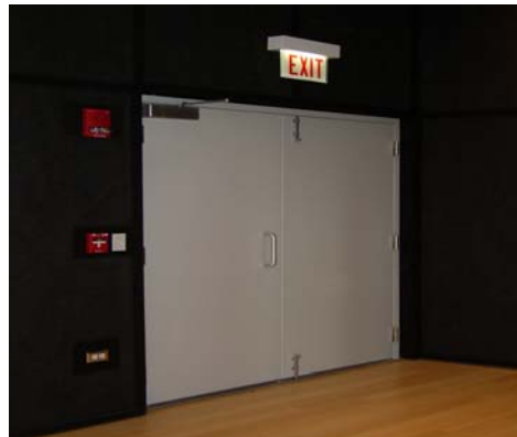
6' x 7' STC 50 Double Leaf Door, Ft. Worth, TX