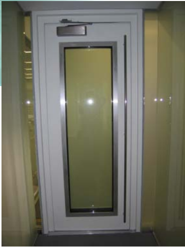
3' x 7'-6" STC 52 Single-Leaf Door fully glazed. New York, NY