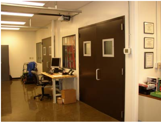
6' x 7' STC 52 Double-Leaf Door with 12" x 12" double glazed windows. New York, NY

NoiseBarriers, LLC. is your turnkey provider for all sound control door needs.