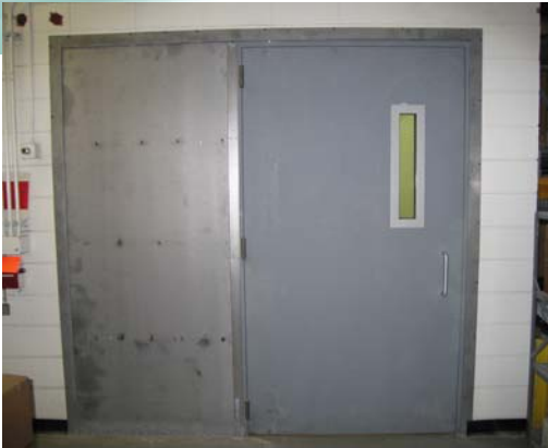
4' x 8' STC 50 Single-Leaf Door with 4" x 25" ADA window and 3' x 8' filler panel. Fond du Lac, WI